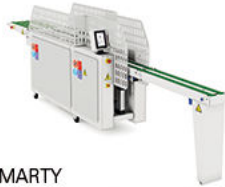
SMARTY Plegadora prend. pequeñas Small garment folder