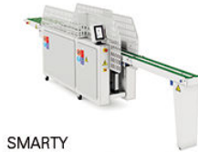
SMARTY Plegadora prend. pequeñas Small garment folder