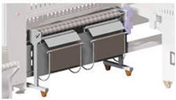
Recogedor post. + bypass (2/4 vías) Rear collector + bypass (2/4 lanes)