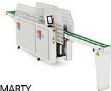
SMARTY Plegadora prend. pequeñas Small garment folder

*Maximum production and speed, variable depending on model, configuration and working conditions.