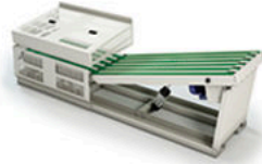
2 Apilador lat. Roll-Off (por arrastre) Side stacker Roll-Off