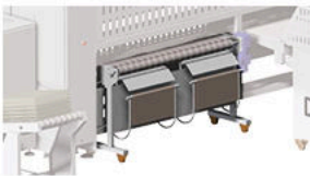
3 Recogedor post. + bypass (2/4 vías) Rear collector + bypass (2/4 lanes)