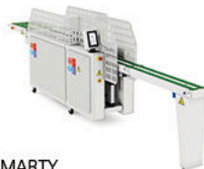
SMARTY Plegadora prend. pequeñas Small garment folder

*Maximum production and speed, variable depending on model, configuration and working conditions.