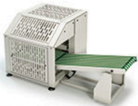
1 Apilador lat. compacto por palas Side standard stacker by blades